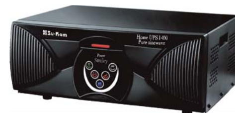
1400 VA / 24 V - Smiley