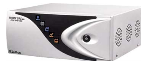
800 VA / 12 V - Falcon