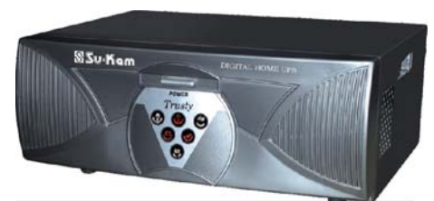
1400 VA/ 24 V - Trusty