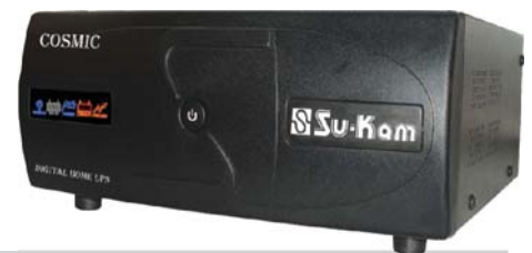
800 VA/ 12 V - Cosmic