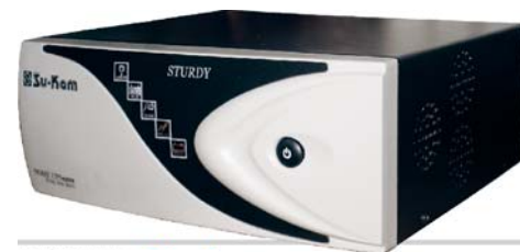
600 VA / 12 V - Sturdy

Note: Indicative values only, actual calculations depend on manufacturer's specifications When PC is running, TV is not recommended