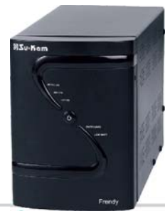
400 VA/ 12 V- Frendy