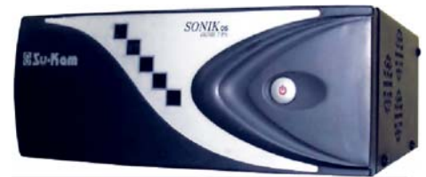
600 VA/ 12 V - Sonik